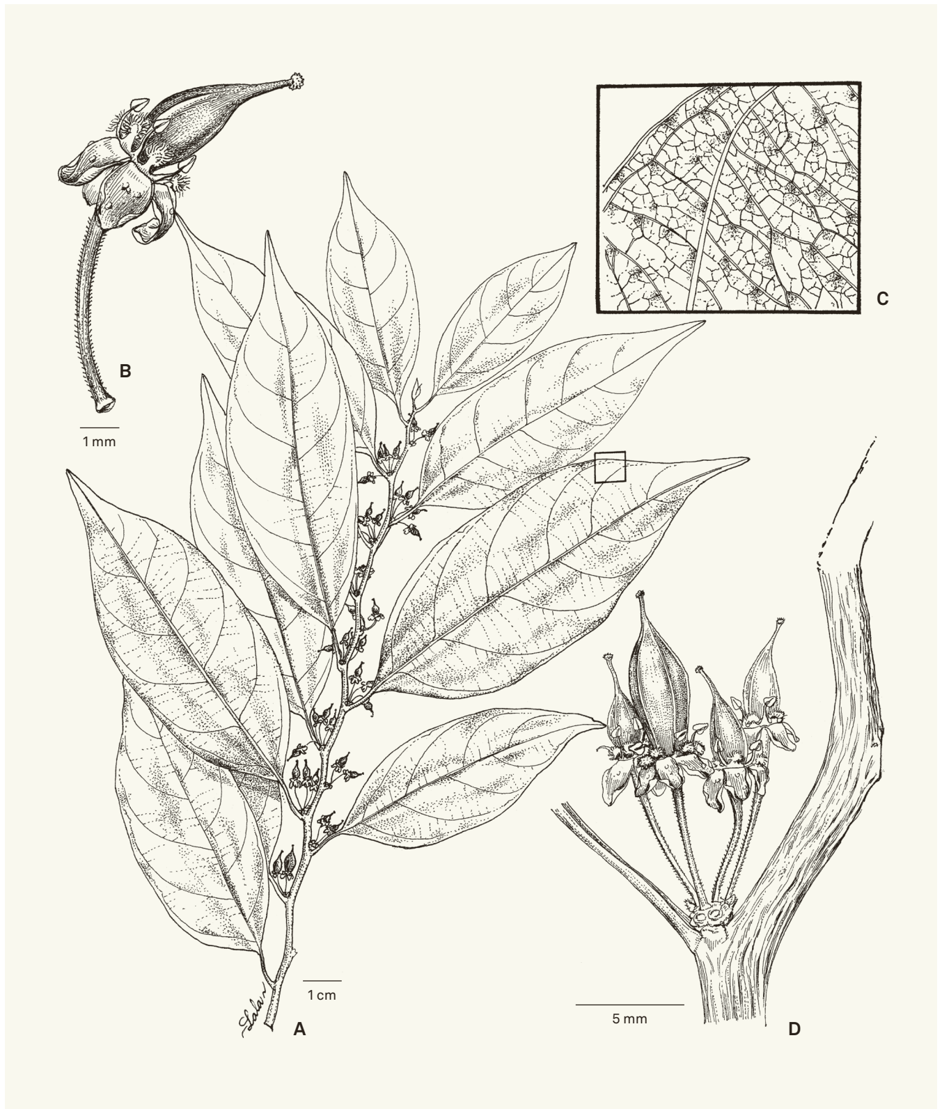
Fig. 1. – Casearia razakamalalae Philpott & Appleg. A. Flowering branch; B. Flower post-anthesis in early fruit development; C. Detail of abaxial leaf surface with conspicuous reticulated higher-order venation; D. Inflorescence. [Razakamalala et al. 5006, TAN] [Drawings: R.L. Andriamiarisoa]